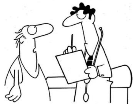
"I must be in the autumn of my life. I feel like a pile of wet leaves."